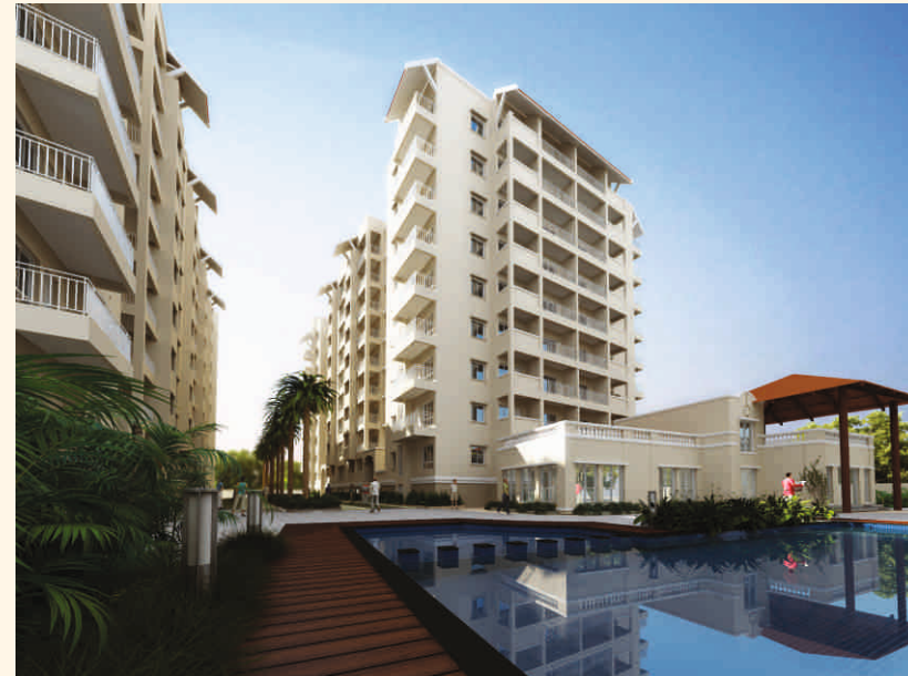
Completed project: SAPTHAGIRI SPLENDOR 171 Units at BTM 4th Stage, Viljaya Bank Colony, BG Road